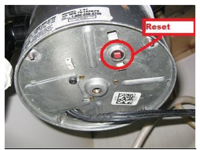
If the disposal still does not work please contact the office.

Please do not EVER put your hand down the drain into the disposal while it is plugged in. If your disposal will not turn on first check to make sure that it is plugged in. If it is, then check your breaker box (located in your kitchen) to make sure the breaker has not flipped. The last thing to try if it's still not working is to press the reset button which can be found on the bottom of the garbage disposal under the sink.